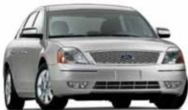
Silver Birch Metallic