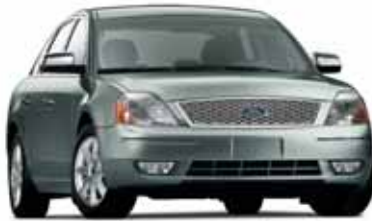
Titanium Green Metallic