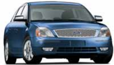
Dark Blue Pearl Metallic