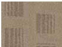
Pebble Cloth Standard on SEL