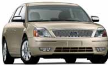
Dune Pearl Metallic